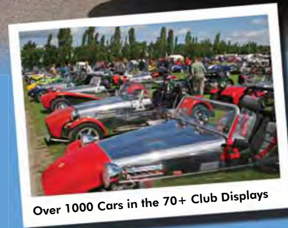
Over 1000 Cars in the 70+ Club Displays