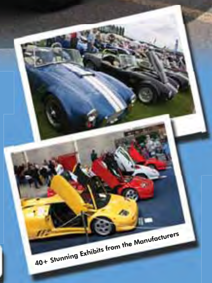
40+ Stunning Exhibits from the Manufacturers